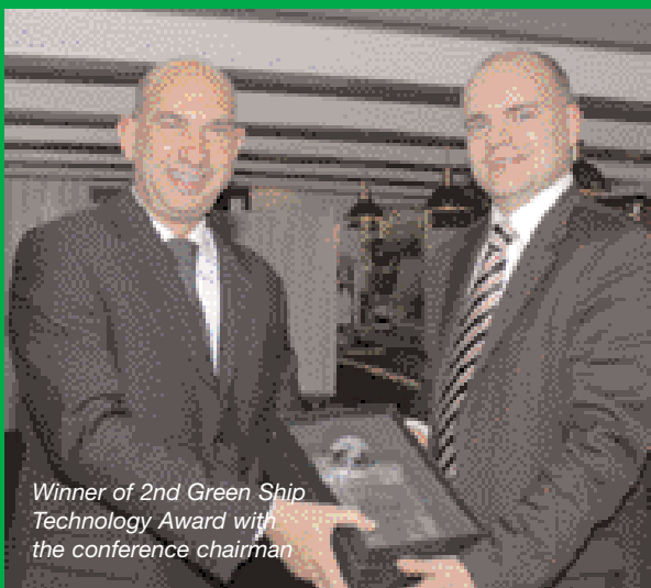
Winner of 2nd Green Ship Technology Award with the conference chairman